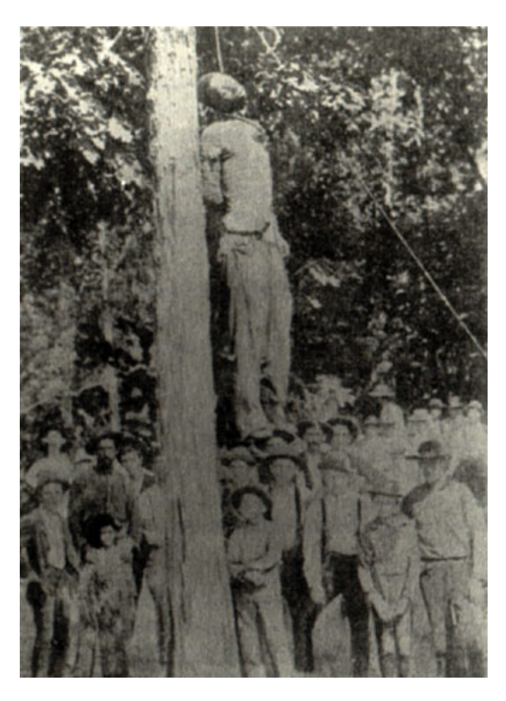
Scene of Lynching at Clanton, Alabama, Aug. 1891

The cut which is here given is the exact reproduction of the photograph taken at the scene of the lynching at Clanton, Alabama, August, 1891. The cause for which the man was hanged is given in the words of the mob which were written of the back of the photograph, and they are also given. This photograph was sent to Judge A. W. Tourgée, of Mayville, N. Y.