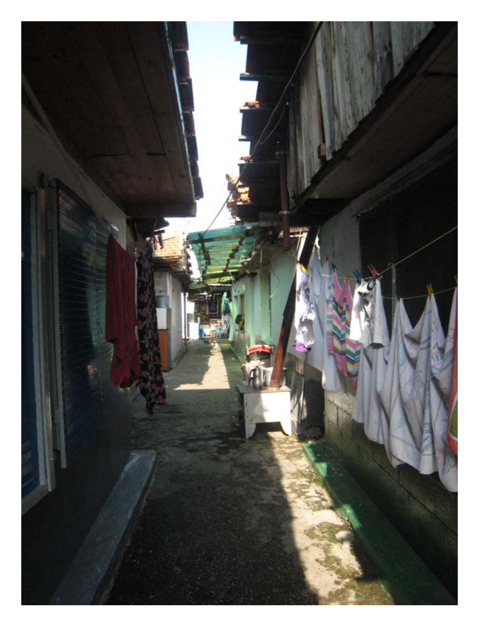
The authorized camp of Via Novara, July 2011.